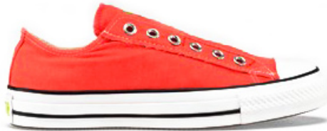
Chuck Taylor Slip