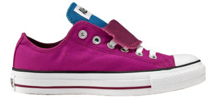
Chuck Taylor Double Tongue